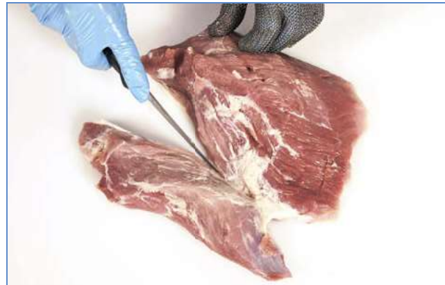
2 The Salmon Cut is removed by following the natural seam.