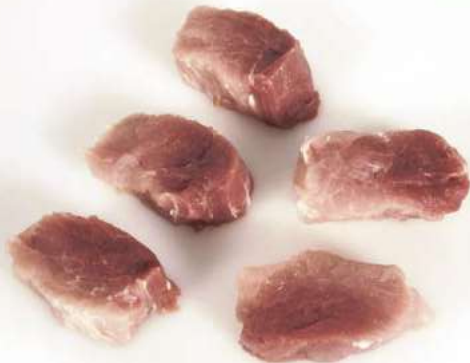
4 Oyster of Pork – Salmon Cut.