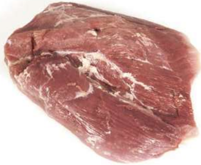
1 Trimmed Silverside with Salmon Cut.