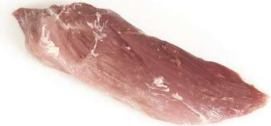
3 Salmon Cut is cut into 15 mm thick steaks. Oysters of Pork.